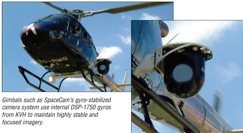
Gimbals such as SpaceCam's gyro-stabilized camera system use internal DSP-1750 gyros from KVH to maintain highly stable and focused imagery.

KVH is the only U.S. FOG manufacturer that draws its own optical fiber, ensuring consistent quality, performance, and instant turn-on to turn-on repeatability in every FOG. And like all of KVH's precision FOGs, the solid state DSP-1750 is built using KVH's patented Digital Signal Processing (DSP) electronics design which offers significant improvements in such critical areas as scale factor and bias stability, scale factor non-linearity, and maximum input rate.