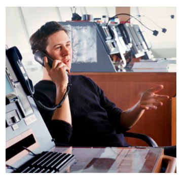
The high-quality voice connection will improve crew morale and provide peace of mind in adverse conditions.

KVH's TracPhone FB150 packs loads of power and a surprisingly