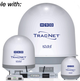
TracNet™ Hybrid Terminals

* KVH Crew Internet is currently available on TracNet terminals; it is not compatible with TracPhone systems. KVH QuickCrew is available on TracPhone terminals.