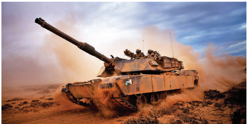
KVH's TACNAV 3D is a perfect solution for main battle tanks.

For situational awareness in GNSS-denied environments, three-dimensional navigation, and battlefield management, KVH's TACNAV 3D is the state-of-the-art navigation engine for today's military technology.