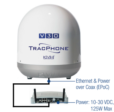
TracPhone V30 Antenna and VSAT-Hub